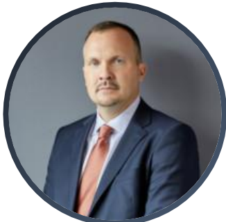
JOHN HOWCHIN Secretary-General, Council on Ethics Swedish National Pension Funds